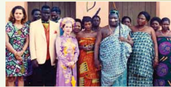
King Agboli-Agbo Dedjani and the Prince of Benin welcomed Supreme Master Ching Hai in Abomey, Benin (1995)