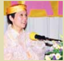
In 1991 and 1992, Supreme Master Ching Hai delivered lectures at the United Nations in New York, USA, and again in Geneva, Switzerland in 1993.

“She is the light of a great person, an angel of mercy for all of us.”