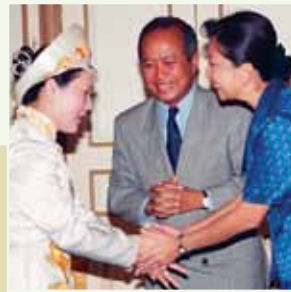
Prince Norodom Ranariddh and Princess Marie Ranariddh Cambodia (1996)