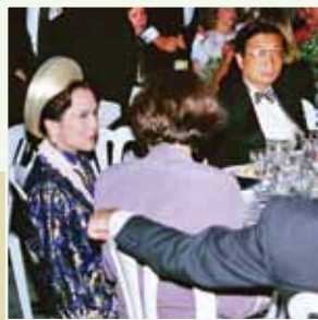
Presidential Banquet Washington, DC, USA (1993)