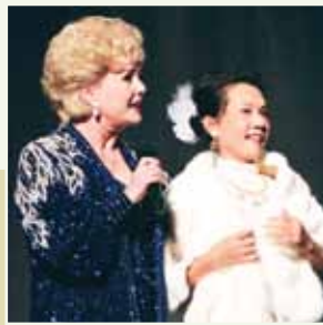
Debbie Reynolds Legendary American actress at One World...of peace through music benefit concert in Los Angeles, California, USA (1998)