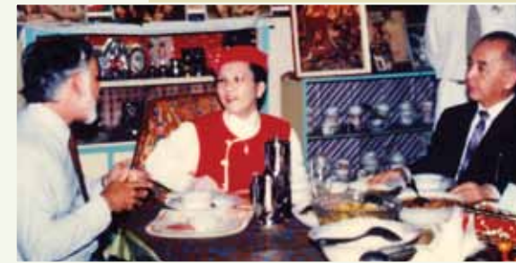
US and Japan Consulates welcomed Supreme Master Ching Hai to Indonesia (1993)