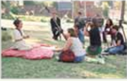
SABC TV Cape Town, South Africa December 1, 1999