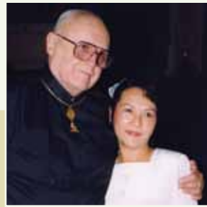
Rod Steiger Oscar Award-winning American actor Night of 100 Stars Oscar benefit gala in Beverly Hills, California USA (1999)