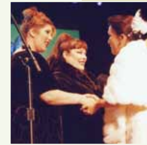
Carnie and Wendy Wilson of the famed Beach Boys Family & Friends at One World...of peace through music benefit concert in Los Angeles, California, USA (1998)