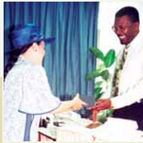
Prime Minister Edison James Dominica (1996)