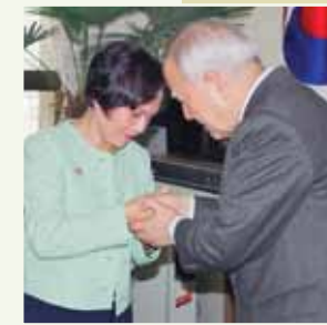
Mayor Cho Soon expressed his hope that Supreme Master Ching Hai would visit Korea often to lecture for the spiritual enlightenment of the Korean people Seoul, Korea (1997)