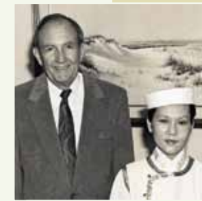
US House of Representative Earl Hutto invited Supreme Master Ching Hai to visit Congress in Washington, DC, USA (1993)