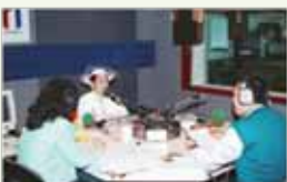
RFI Radio Paris, France, January 27, 1997