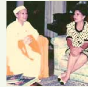
Second Lady Celia Diaz-Laurel Philippines (1992)