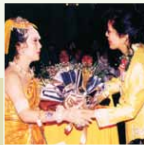
Sudarat Keyuraphan Deputy Government Spokesperson hosted a welcome banquet held by the Department of Foreign Affairs for Supreme Master Ching Hai, who was escorted to the event by Nimitr Ajchariyakitisakool, the Secretary of Foreign Minister, Thailand (1993)