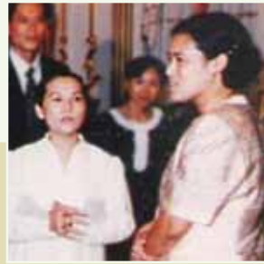
Princess Maha Chakri Sirindhorn Thailand (1994)