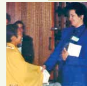
Former First Lady Margarita Penón Góngora Costa Rica (1991)