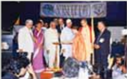
World Convention on Reverence For All Life Pune, India November 11, 1997