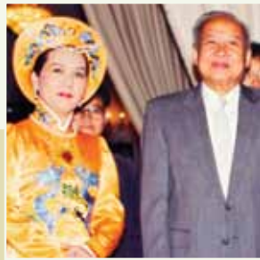
King Preah Bat Samdech Preah Norodom Sihanouk Varman greeted Supreme Master Ching Hai in his royal palace in Cambodia and presented her a vase as a token of friendship (1996)