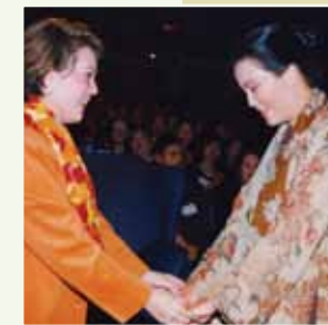
Kiêu Chinh Distinguished Aulacese (Vietnamese) actress A Journey through Aesthetic Realms benefit concert in Washington, DC, USA (1997)