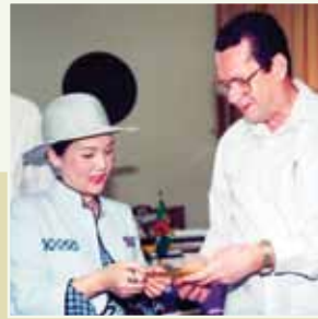
President Crispin Sorhaindo Dominica (1996)