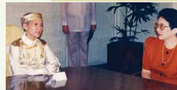
President Corazón Cojuangco-Aquino met with Supreme Master Ching Hai to discuss refugee resettlement in the Philippines (1992)