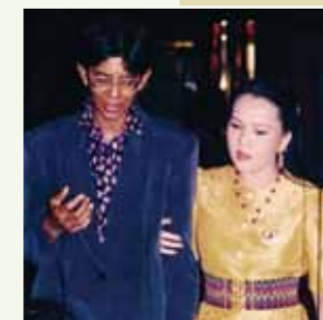
Dr. Lalitha Rajahram wife of Minister for Foreign Affairs and Minister for Law Singapore (1996)