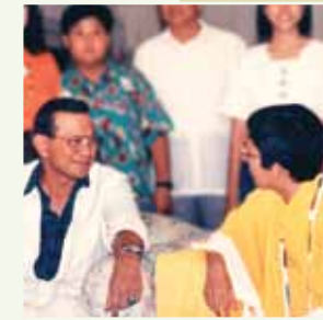
Vice President Salvador Laurel Philippines (1991)