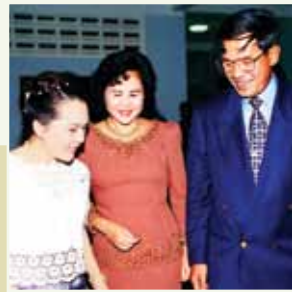
Prime Minister Samdech Hun Sen and wife Bun Ramy Cambodia (1996)