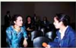
French Radio Enghien Paris, France January 27, 1997