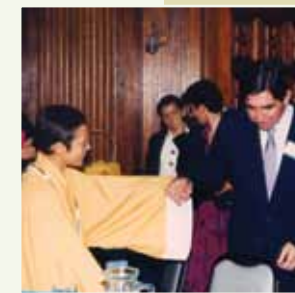
President Óscar Arias Sánchez Costa Rica (1991)