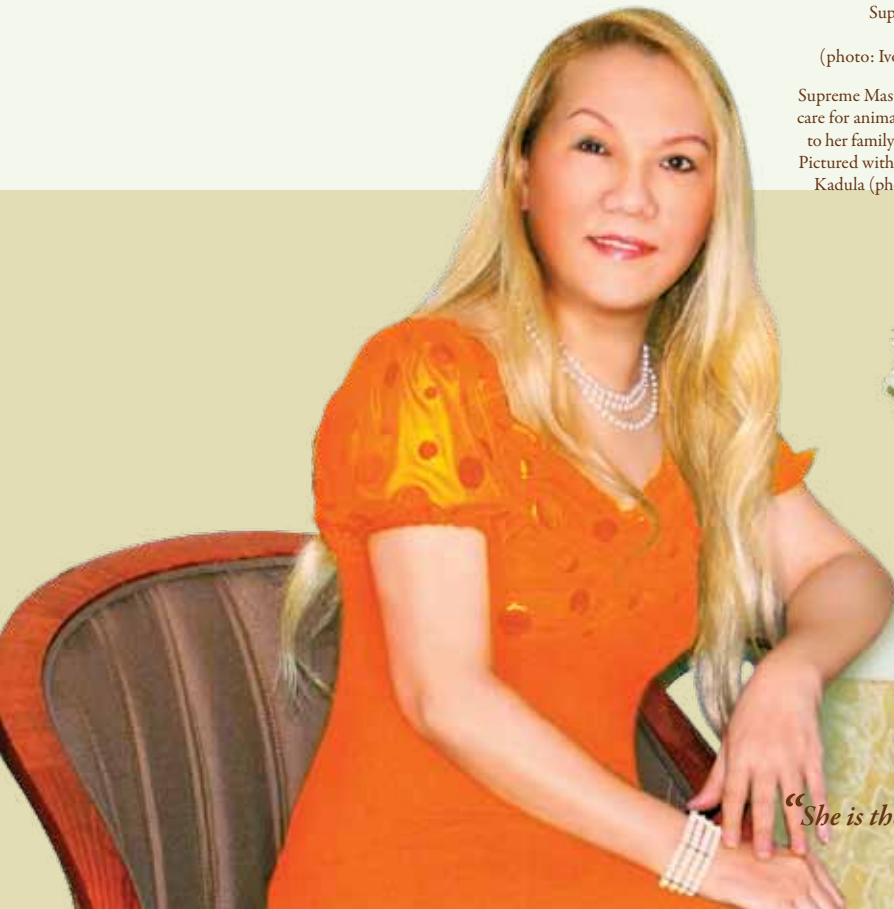
Supreme Master Ching Hai on a humanitarian trip (photo: Ivory Coast, Africa, 1995)