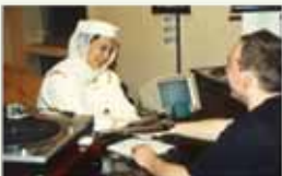
Schweizer Radio DRS Switzerland 1993