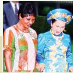
First Lady Henriette Bedié Côte d'Ivoire (1996)