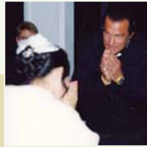
Steven Seagal Famed American actor St. Jude Children's Research Hospital's 19th annual benefit gala in Beverly Hills, California, USA (1999)