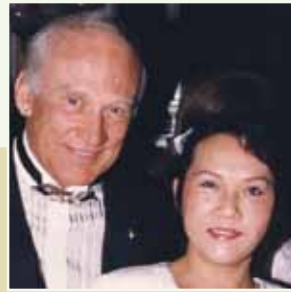
American astronaut Buzz Aldrin Second man to step foot on the moon Night of 100 Stars Oscar benefit gala in Beverly Hills, California USA (1999)