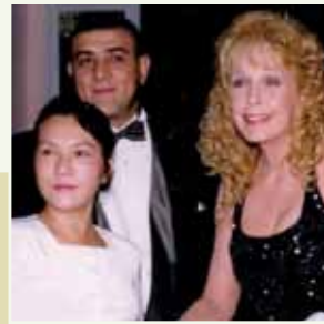
Stella Stevens Golden Globe-winning American actress Night of 100 Stars Oscar benefit gala in Beverly Hills, California USA (1999)