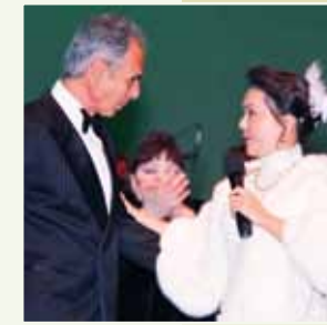
Bill Conti Oscar and Emmy Award-winning American composer at One World...of peace through music benefit concert in Los Angeles, California, USA (1998)