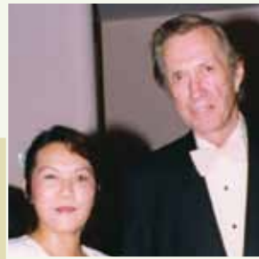
David Carradine Legendary American actor Night of 100 Stars Oscar benefit gala in Beverly Hills, California USA (1999)