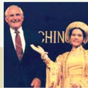
Mayor Frank Fasi proclaimed Oct. 25 as Supreme Master Ching Hai Day in Honolulu, Hawaii, USA (1993)